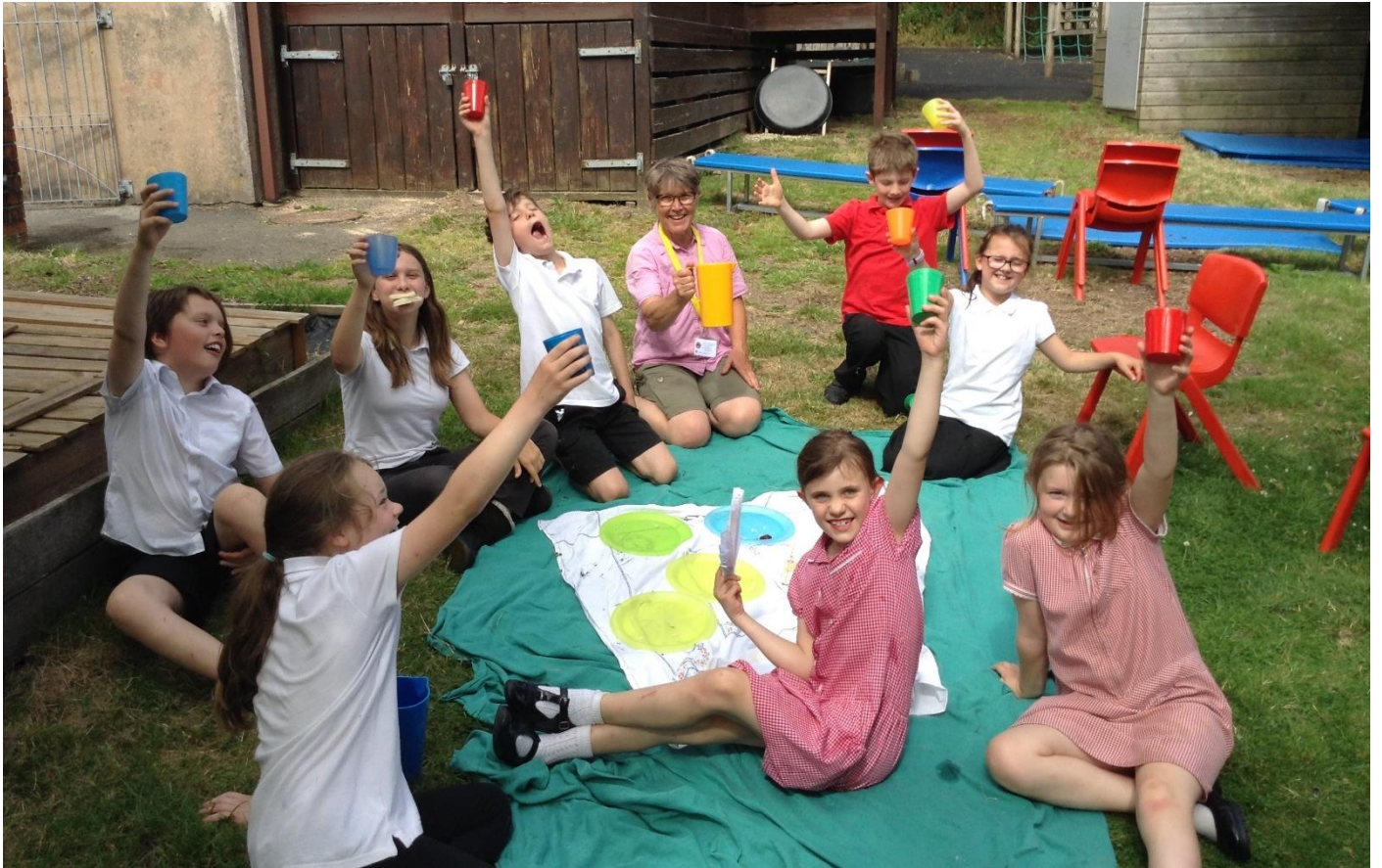
Class 2 enjoying Art

Gardening club enjoyed a picnic with some of the produce they have grown.