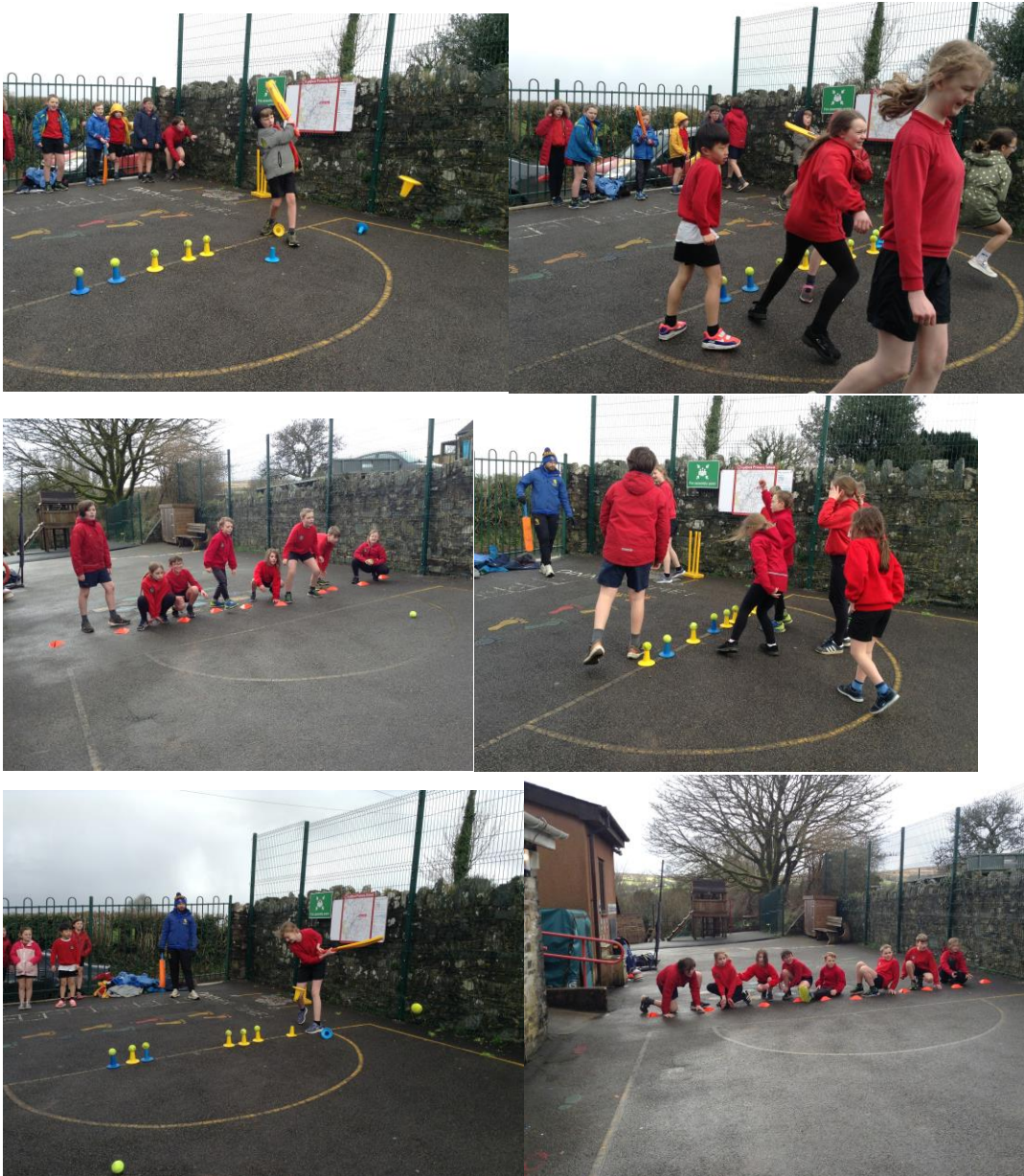
Class 2 enjoying their cricket session with Devon Cricket.