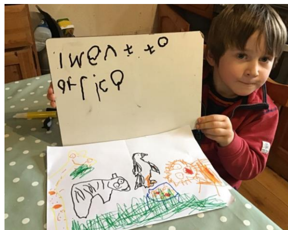
James' penguin has gone to Africa