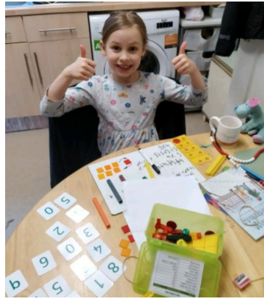
Learning maths is fun