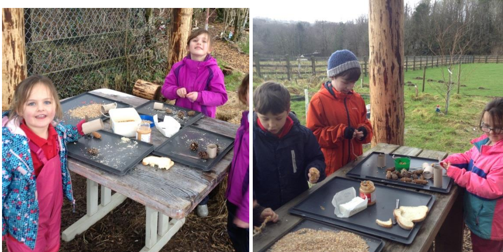
Making bird feeders in Forest School