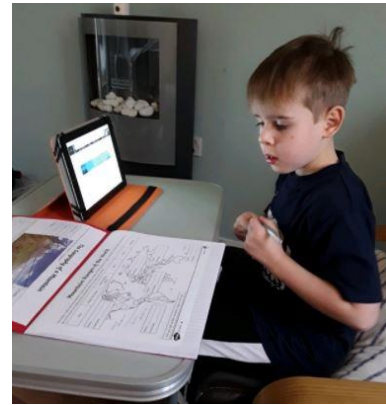
Massan's learning space