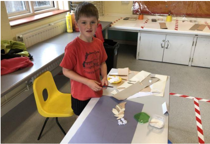
Art activities in school