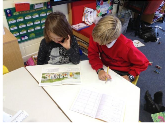
Peer reading in Class 1