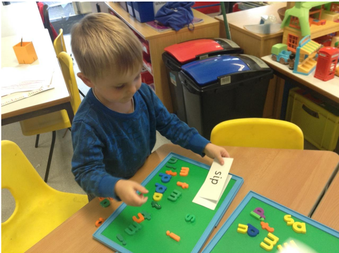
EYFS Phonics word building in Class 1