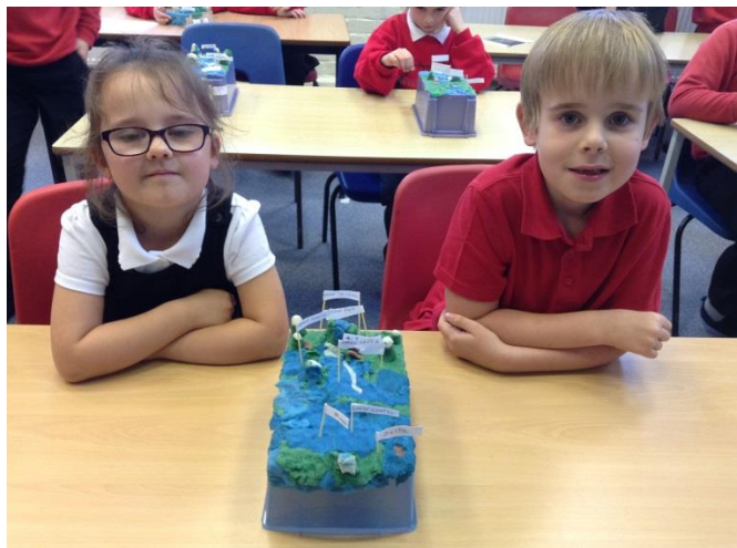
Making river models