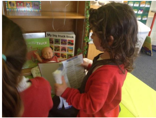
Reading in the book corner