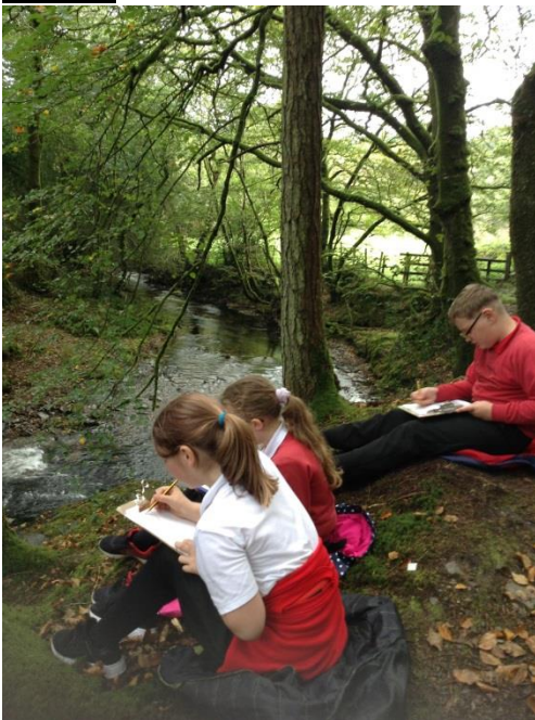
Geography trip to study the river