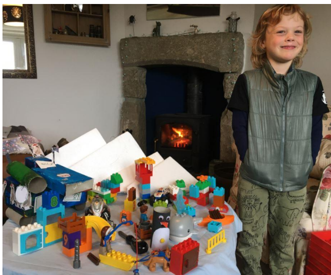
Wilf's Antarctic World