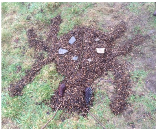
Forest School leaf sculpture